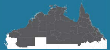
Table 1: Northern Australia key statistics